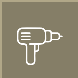
High protection against burglary