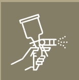
Superior corrosion resistance paint finish