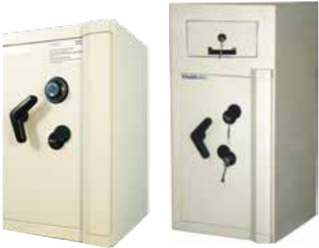
NIGHT DEPOSITORY SAFE