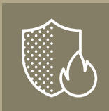
Resistance against fire