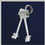
Double bitted keys