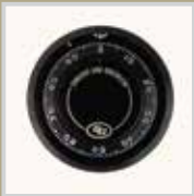
Mechanical combination lock