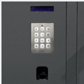
Biometric access control system