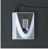
Biometric access control system