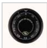
Mechanical combination lock