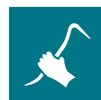
High protection against burglary