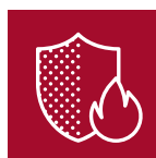
Resistance against fire