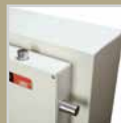
Monolithic door slab for high protection