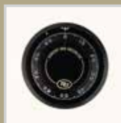
Mechanical combination lock