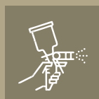
Light paint finish to suit most office environments