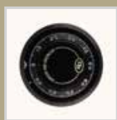
Mechanical combination lock