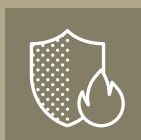
Resistance against fire