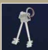
Double bitted keys